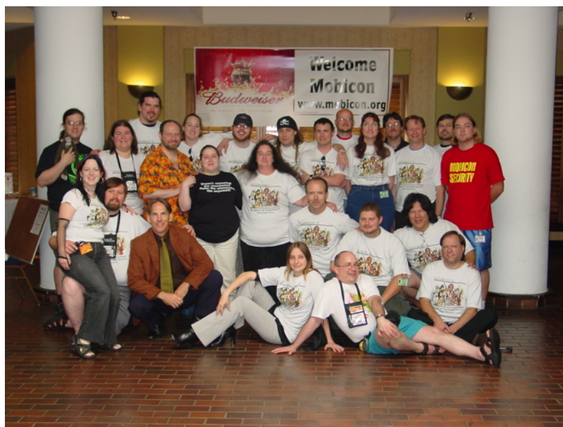
MOBICON Staff and Guests welcome Members.