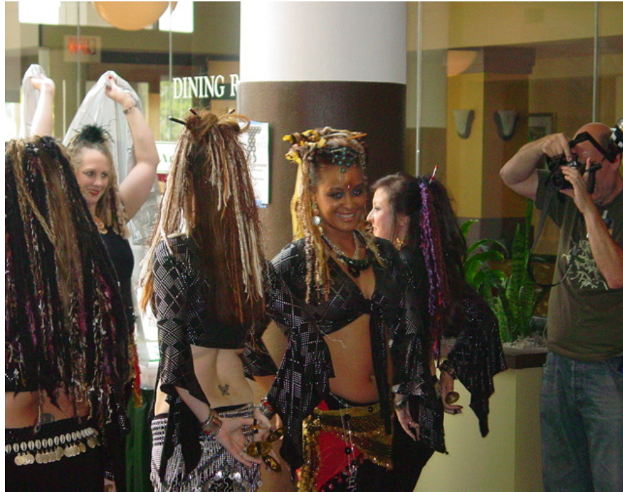
The Zuri Dance Company delights visitors with a performance.